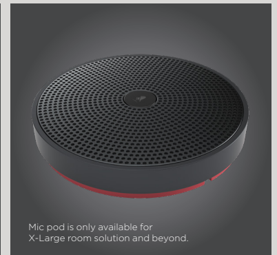
Mic pod is only available for X-Large room solution and beyond.