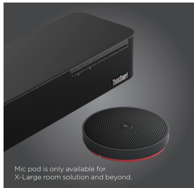
Mic pod is only available for X-Large room solution and beyond.

©2021 Lenovo. All rights reserved. These products are available while supplies last. Prices shown are subject to change without notice. For any questions concerning price, please contact your Lenovo Account Executive. Lenovo is not responsible for photographic or typographic errors. Warranty: For a copy of applicable warranties, write to: Warranty Information, 500 Park Offices Drive, RTP, NC 27709, Attn: Dept. ZPYA/B600. Lenovo makes no representation or warranty regarding third-party products or services. Trademarks: Lenovo, the Lenovo logo, Rescue and Recovery, ThinkPad, ThinkCentre, ThinkSmart, ThinkStation, ThinkVantage, and ThinkVision are trademarks or registered trademarks of Lenovo. Microsoft, Teams, and Teams Rooms are registered trademarks of Microsoft Corporation. Zoom Rooms is a registered trademark of Zoom Video Communications, Inc. Other company, product and service names may be trademarks or service marks of others.