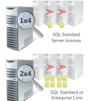
SQL 2017 Enterprise Core Virtualization Rights Licensing all the physical cores